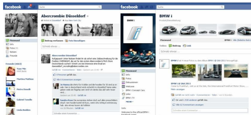
Graph 04: Screen-Shot of the Facebook page of Abercrombie and page of BMW [18, 21]

Reviewing the continuously growth of the importance of Facebook inside the marketing mixture and also the success of companies like Adidas or other lead to the question: “In the age of social media, are brand websites (less) relevant?”