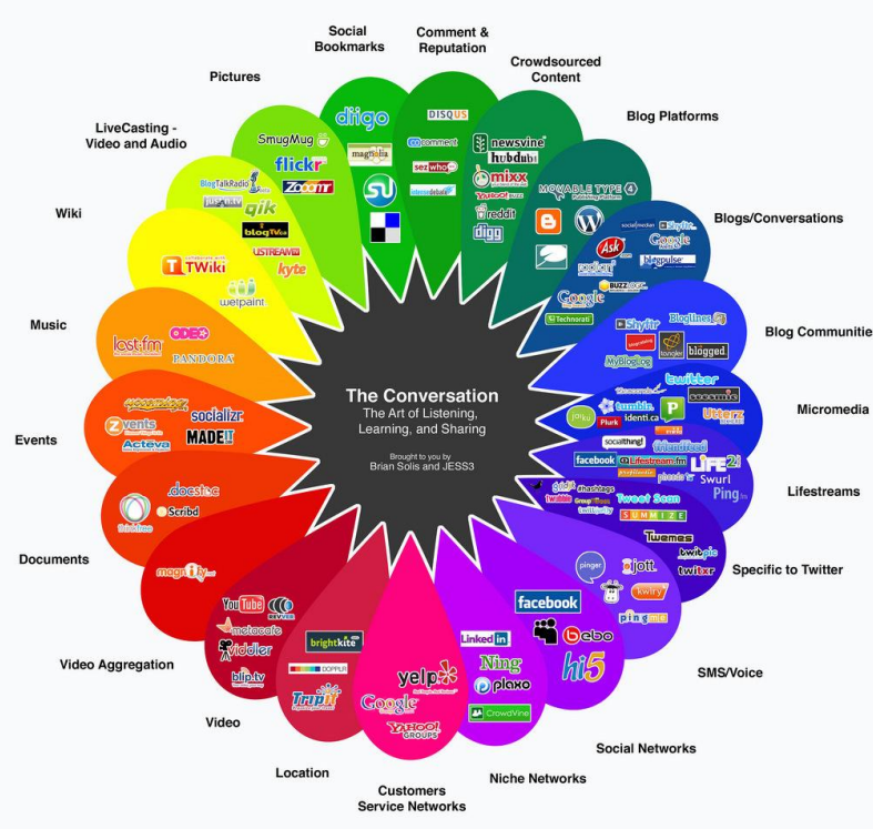
Graph 01: The art of conversation - online channel proliferation [8]

For marketers, Web 2.0 offers an opportunity to engage consumers. A growing number of marketers are using Web 2.0 tools to collaborate with consumers on product development, service enhancement and promotion. Companies can use Web 2.0 tools to improve collaboration with both its business partners and consumers. Among other things, company employees have created wikis, Web sites that allow users to add, delete and edit content, to list answers to frequently asked questions about each product, and consumers have added significant contributions. Another marketing Web 2.0 bait is to make sure consumers can use the online community to network among themselves on topics of their own choosing [9].